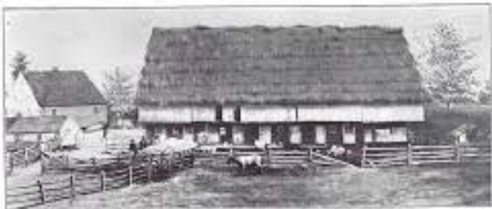
The Inn at New Lane, located on main road at Lancaster, Pa., where the first American born deacons were organized in 1714. "The Church of the United Brethren in Christ".