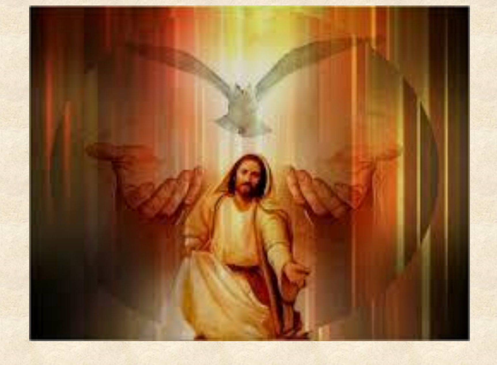
TRINITY, UNITY, HUMANITY