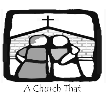
A Church That C.A.R.E.S.

Connecting Affirming Reaching Equipping Sending